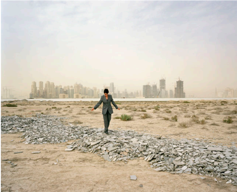
Figure 1. Carey Young, Body Techniques (after A Line in Ireland, Richard Long, 1974) , 2007. Digital C-Type print, 59 3/4 x 48 inches.

with businessperson, and staging a reciprocal relationship between this figure and the homogenous landscapes of globalised service industries, Body Techniques acknowledges art's complicity in the very processes that Young critiques, underlining the ease with which art world mechanisms smoothly digest such critique and re-deploy it as cultural capital. 41