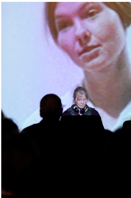
Figure 4. Faith Wilding, Wait-With , 23 January 2009. Performance at re.act.feminism , Akademie der Künste, Berlin.

Feminist Art Program were highly conflictual, as the women grappled with power structures and competition; Wait-With continues this spirit of pedagogic contestation, treating the originary work as an adaptable lesson plan rather than a fixed formula. 54