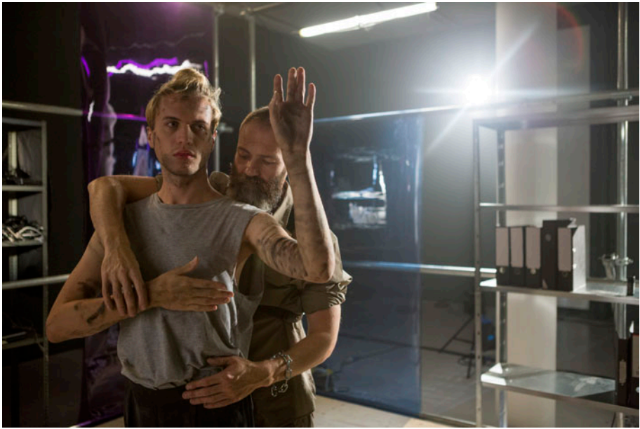
Figure 8. Patrick Staff, The Foundation , 2015. Video still.

Staff's desire to establish trans-generational conduits that might facilitate questioning and dialogue around gender identity resonates with theorizations of queer temporality, the returns, repetitions and ellipses of which contrast with what Muñoz summarizes as the 'autonaturalizing temporality that we might call straight time ', in which 'the only futurity promised is that of reproductive majoritarian heterosexuality, the spectacle of the state refurbishing its ranks through overt and subsidized acts of reproduction.' 77 The Foundation stages generational difference to try and break through genealogy and achieve anachronistic, cross-temporal connection, whereby being 'out-of-joint' might enable relation, rather than conformist reiteration. In a valuable examination of the relationship between queer feminist re-enactment and pedagogy, Catherine Grant employs Bertolt Brecht's concept of the 'learning play' to explore the inter-subjective connections forged through the rehearsal process. 78 Significantly, Grant reads the trope of 'temporal disruption as a space of possibility' that permeates the literature on re-enactment as 'a space of learning'. 79 Staff's disorientating combination of documentary, archival and theatrical registers in The Foundation operates in this way, although Staff highlights the danger that the 'space of learning' might involve disciplinary control as well as ludic possibility.