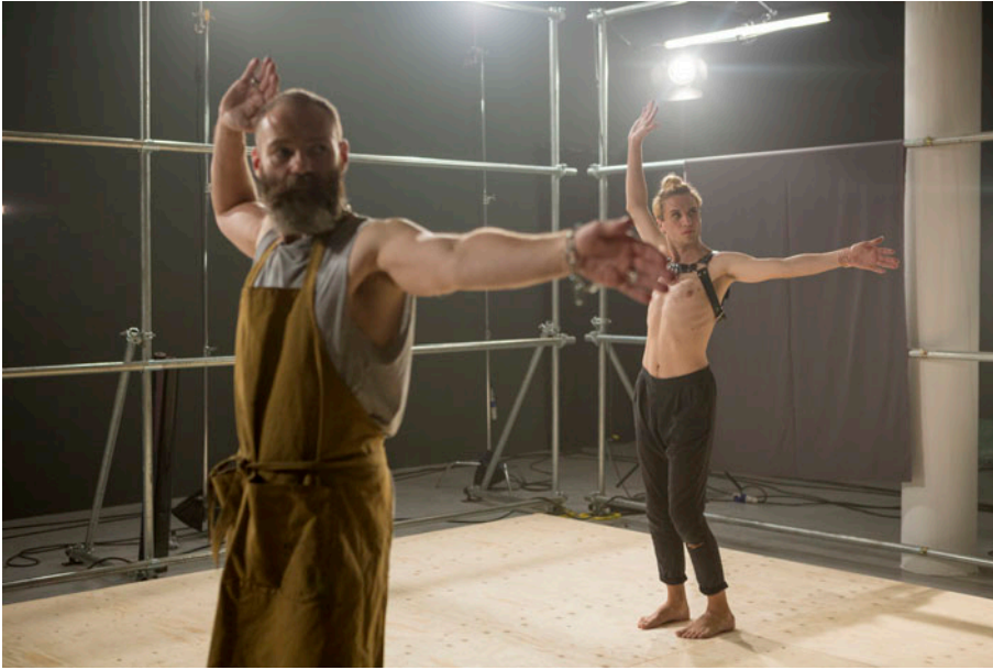
Figure 7. Patrick Staff, The Foundation , 2015. Video still.

his works, but rather in the more ‘subliminal’ effect of their sex-positive, non-shaming ethos. 73 The dynamic of domination in The Foundation is redolent of both BDSM role-play and the pedagogic set-up. BDSM and pedagogy are intimately intertwined in the histories of sexuality and identity nurtured by the Foundation; Catherine Lord identifies the ‘whips and chains, slings and boots, uniforms and lube’, neatly arranged in the functioning sex-dungeon that continues to occupy the basement of the house, as ‘the props of a classroom’. 74 While the teacher-student relationship between the two figures seethes with antagonism, it thus also testifies to shared histories that can be simultaneously registered, and critiqued productively.