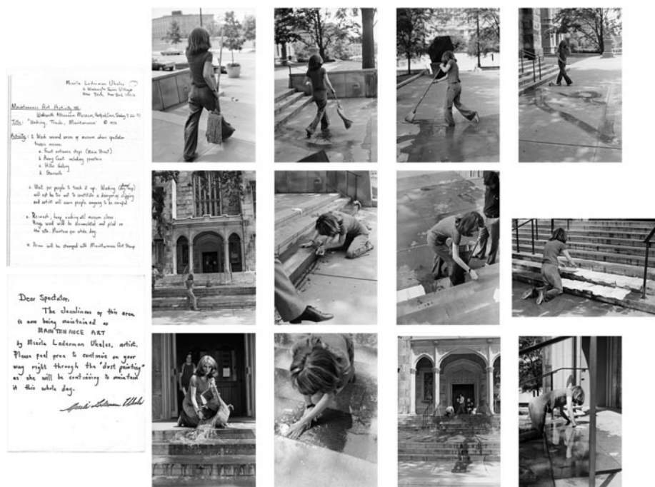
Figure 3. Mierle Laderman Ukeles, Hartford Wash: Washing/Tracks/Maintenance (Outside), 1973. Part of Maintenance Art performance series, 1973-1974. Performance at Wadsworth Atheneum, Hartford, CT. Courtesy Mierle Laderman Ukeles and Ronald Feldman Gallery, New York.